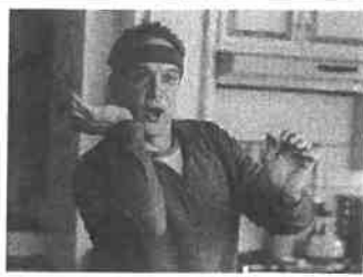
Diedrich Bader in "American Housewife" MasterChef KCVU 8:00 p.m. Gordon Ramsay, Aaron Sánchez and Joe Bastianich mentor the remaining home cooks as they compete for the $250,000 prize in this rebroadcast of the Season 10 finale. The home cooks have faced numerous culinary challenges designed to test their skills.